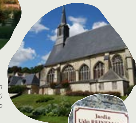
Song recital in Saint-André church (FR) for one selected duo