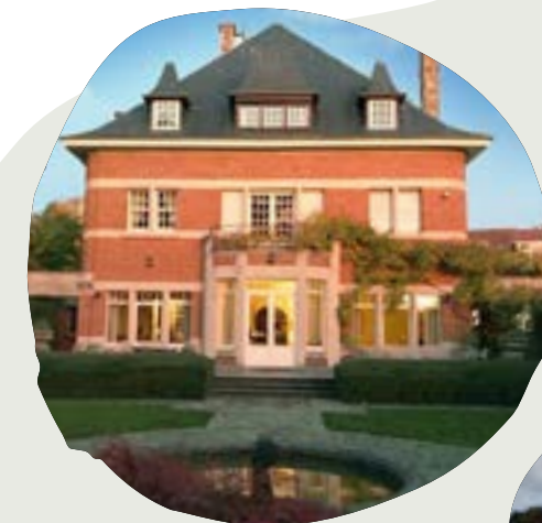
Maison Solanet, Urim's home