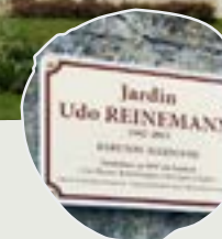
Garden next to Saint-André church, named after this beloved honorary citizen